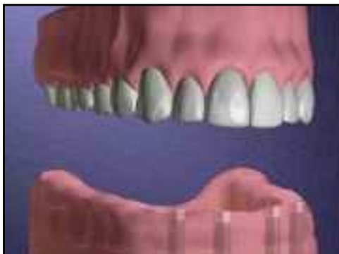
Implants in lower jaw

Using dental implants to support either a lower denture or bridge will keep the pressure off the bone and the nerves. The implants also help stop the bone loss in the jaw that continues once teeth have been removed. Securing restorations with dental implants can make a world of difference, allowing you to eat, talk, laugh, and smile with confidence again.